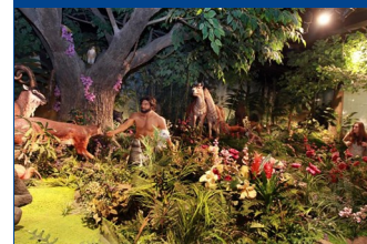
Visit to the Amazing Creation Museum!