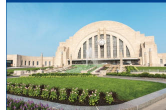
Incredible Cincinnati Museum Center, including an Omnimax Show