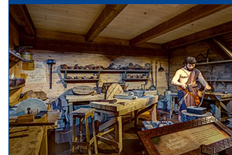
View from Inside the Ark Encounter